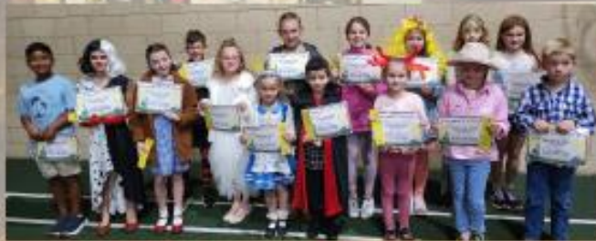
Reading Challenge Participants.