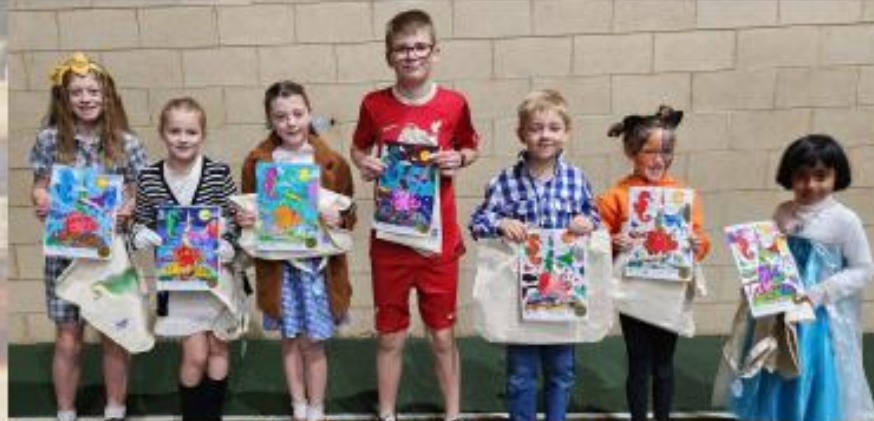
Colouring Competition Winners.